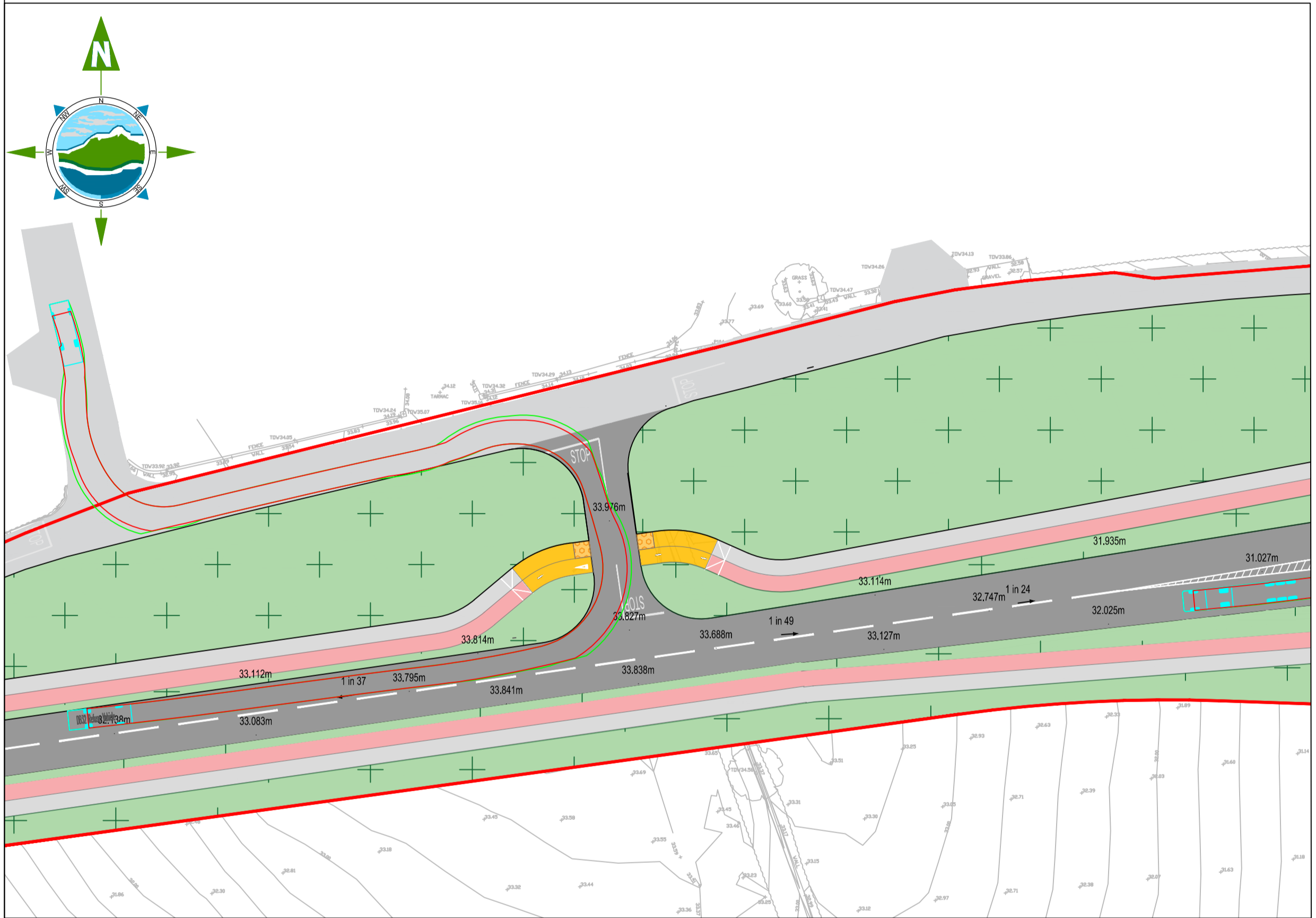
EXISTING ROAD SWEPT PATH - REFUSE TRUCK